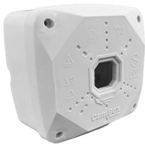
Safir S600 PRO