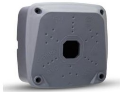
EVO HQ 128 BLACK