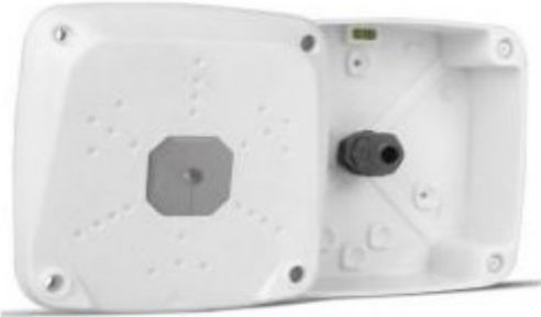
EVO HQ 128 PRO PLUS SET